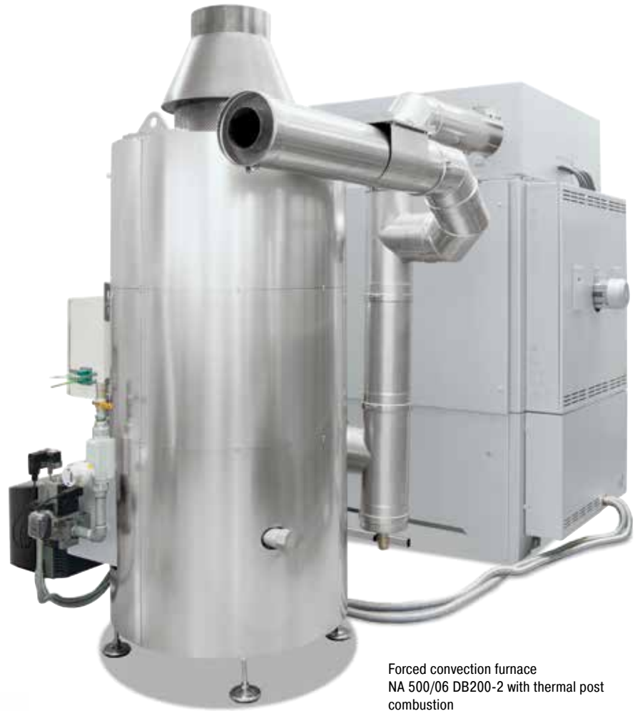
Forced convection furnace NA 500/06 DB200-2 with thermal post combustion