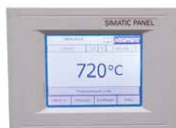
Precision of the controls, e.g. +/- 1K

In standard furnaces a temperature uniformity is guaranteed as +/- K without measurement of temperature uniformity. However, as additional feature, a temperature uniformity measurement at a reference temperature in the work space compliant with DIN 17052-1 can be ordered. Depending on the furnace model, a holding frame which is equivalent in size to the charge space is inserted into the furnace. This frame holds thermocouples at defined measurement positions (11 thermocouples with square cross-section, 9 thermocouple with circular cross-section). The temperature uniformity measurement is performed at a reference temperature specified by the customer at a pre-defined dwell time. If necessary, different reference temperatures or a defined reference working temperature range can also be calibrated.