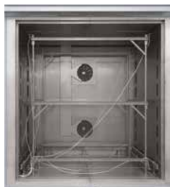
Pluggable frame for measurement for forced convection chamber furnace N 7920/45 HAS