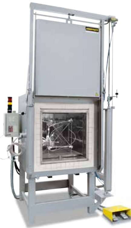
Holding frame for measurement of temperature uniformity

Temperature uniformity is defined as the maximum temperature deviation in the work space of the furnace. There is a general difference between the furnace chamber and the work space. The furnace chamber is the total volume available in the furnace. The work space is smaller than the furnace chamber and describes the volume which can be used for charging.