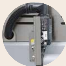
Heating switches off when the lid is opened