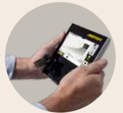
Removable controller with touch operation (see page 58)