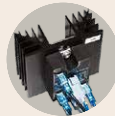
Solid state relays ensure low-noise heater operation